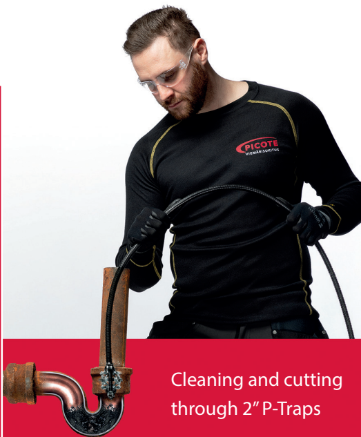
Cleaning and cutting through 2" P-Traps