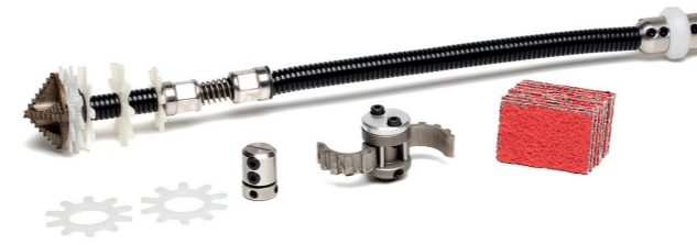
Selection of additional tooling